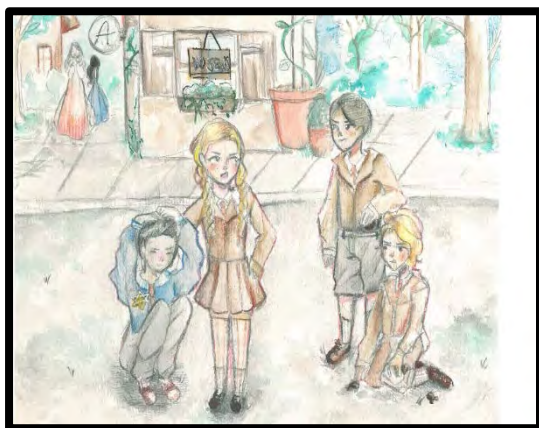
2019 Winner – Analays Gutierrez Grade 5, Dante B. Fascell Elementary

Contest Dates: September 9, 2019 – May 8, 2020